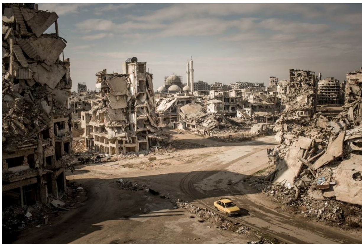
Road to Ruin. Syria, January 2017 Homs

In May 2014, the last civilians left 13 neighborhoods in the heart and surroundings of the old city of Homs, after a siege that lasted about three years, during which old Homs was subjected to massive bombardment and almost complete destruction that pushed most of its people to seek refuge and displacement. This ended with an agreement between the government and the opposition under Russian auspices, which led opposition fighters to depart to the northern countryside of Homs.